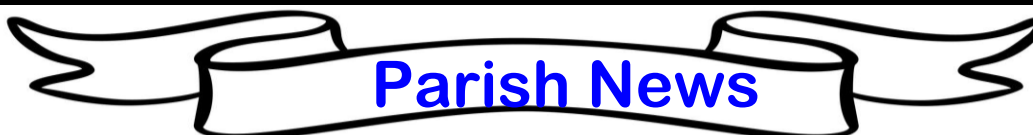
Project TOMR Update (as at 2 nd July)

FOR ALL MASS INTENTIONS, PLEASE REFER TO THE CHURCH NOTICEBOARD